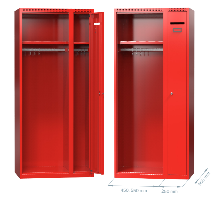
2x full shelf, 2x clothes rail with three metal hooks, cylinder lock, name plate